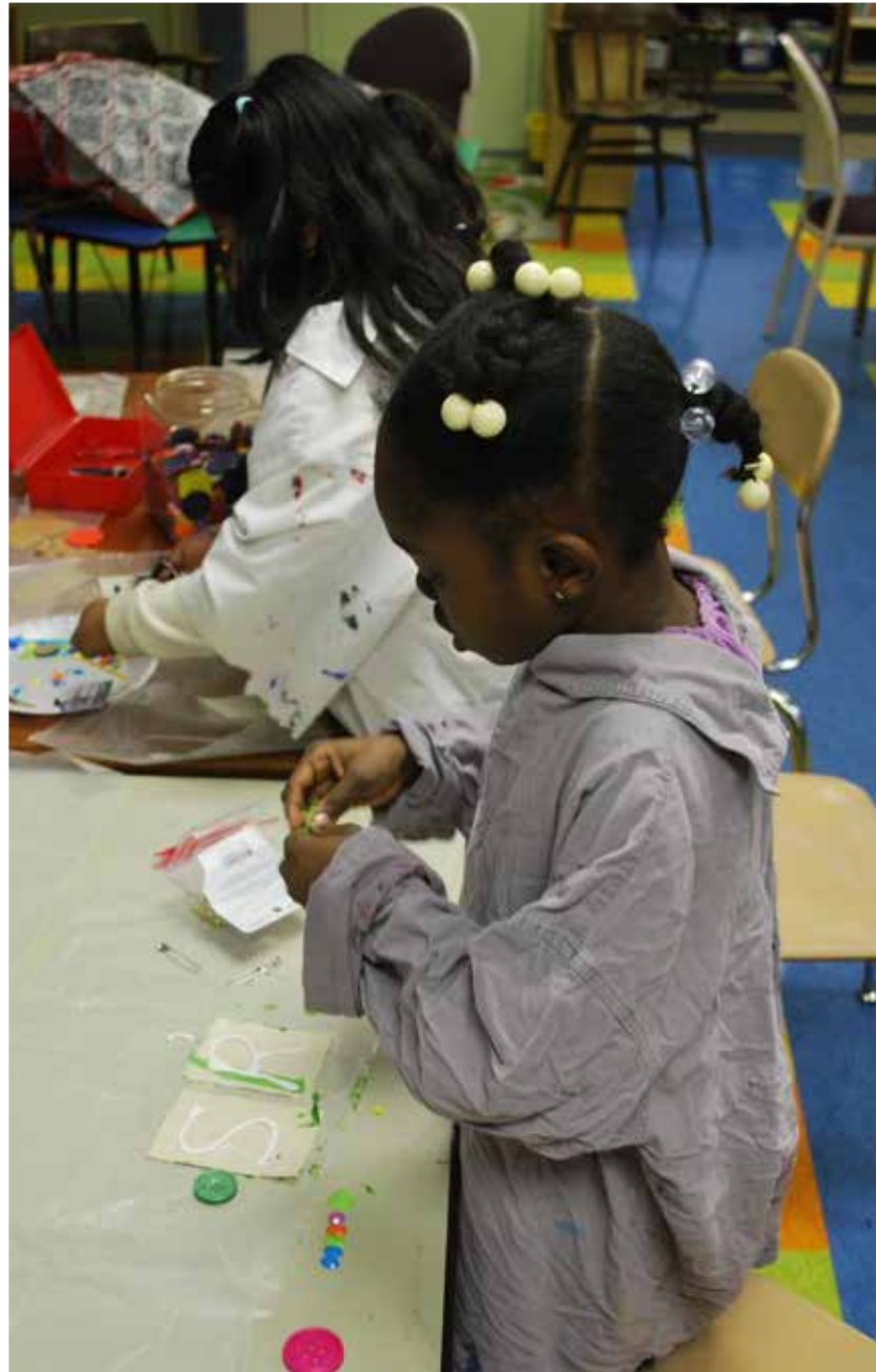
Top: A young student from the Arts Council's ArtReach program makes holiday crafts.