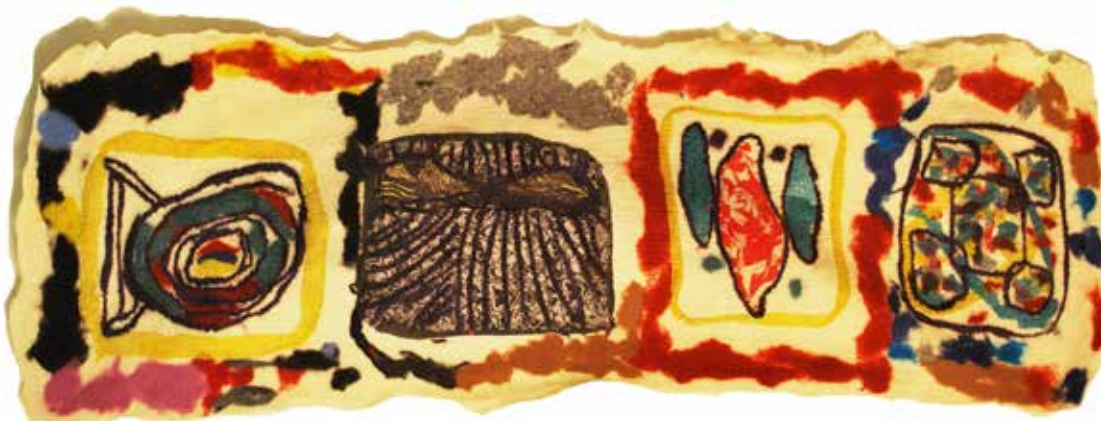
Bottom: The finished work from Pirooska Toth's Homeschool: Fiber Exploration class.