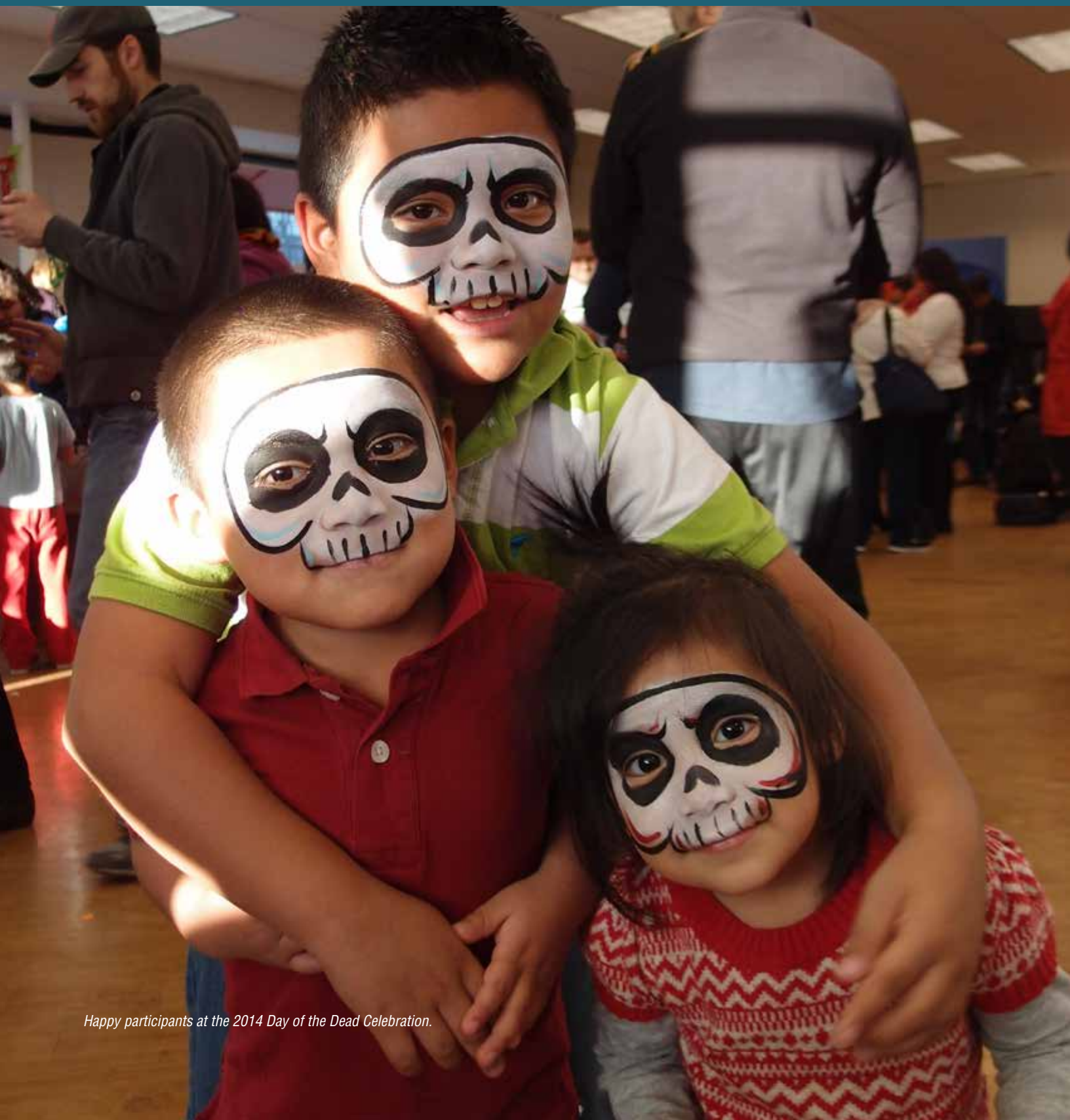
Happy participants at the 2014 Day of the Dead Celebration.

engaging, affordable, and accessible to the diverse population in the greater Princeton region. Creating art and learning from working artists and performers in intimate artistic encounters directly speaks to the Arts Council's mission. Through these experiences, all people are encouraged to engage in the artistic process.