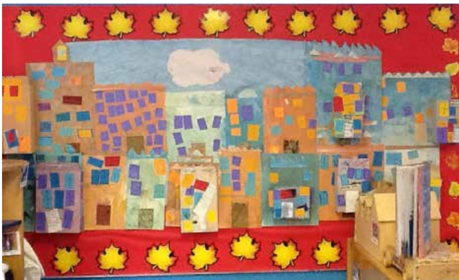
The Arts Council partners with Princeton Nursery School, who provides subsidized Pre-K education for neighborhood children. This mural created by PNS students is called Paper City.

Throughout the year, the Arts Council of Princeton presented the Paint Out Princeton program at several locations throughout the community. Sites included Morven Museum and Garden, Grounds For Sculpture, and downtown Princeton during Communiversity ArtsFest. These unique workshops allow painters the opportunity to transform our community's beautiful grounds into their studio for an afternoon of painting en plein air. A reception was held on May 3 at The Paul Robeson Center for the Arts to celebrate the work created during Paint Out sessions.