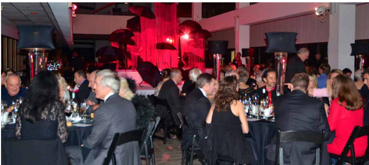
Dining by Design 2014