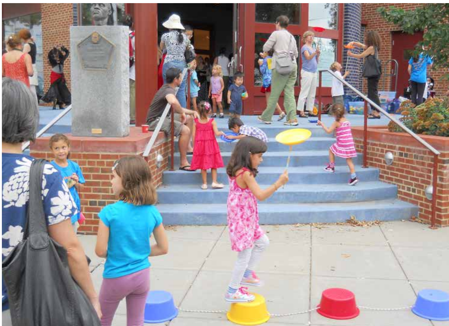
Families enjoy the Arts Council's Fall Open House.